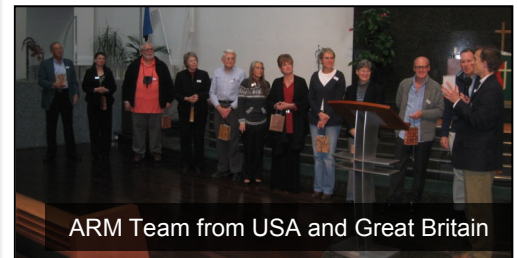
ARM Team from USA and Great Britain

This team served our pastors and lay people in various places of Estonia, beginning with a seminar titled "Lord, Teach Us to Pray" in Parnu Agape Church and finishing with the "Life in the Spirit" seminar in Tallinn UMC. While in Estonia they visited Parnu Agape, Voru, Viitka, Tartu St Luke, Johvi, Kohtla-Jarve, Sillamae, Aseri, Narva and Tallinn UMC. They also had a short visit to Camp Gideon. This was a very blessed time. The ARM team helped us discover what Jesus had promised to His followers about the power from Heaven. This is a step forward toward the renewing church.